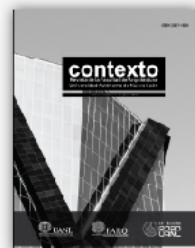
Vol. 11, No. 14, Marzo 2017